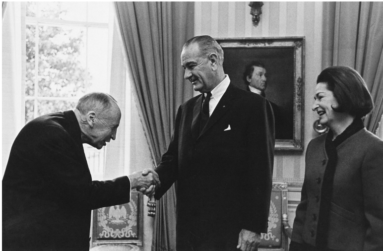
Figure 7.3: Van Vleck receiving the National Medal of Science in 1966 from President Lyndon B. Johnson with Lady Bird Johnson looking on.

Over the same period, Van Vleck had been busy pursuing the line of inquiry that would secure him fame as an expert in magnetism. He published a three-part paper that advanced a general theory of susceptibilities (Van Vleck 1927a; 1927b; 1928a). This trilogy would form the basis for The Theory of Electric and Magnetic Susceptibilities (Van Vleck 1932b).